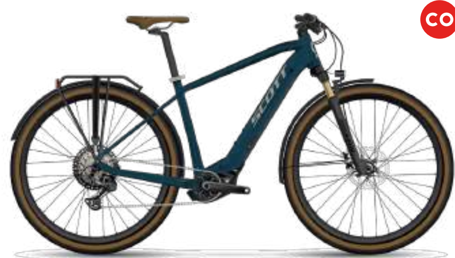
SUB ACTIVE eRIDE MEN