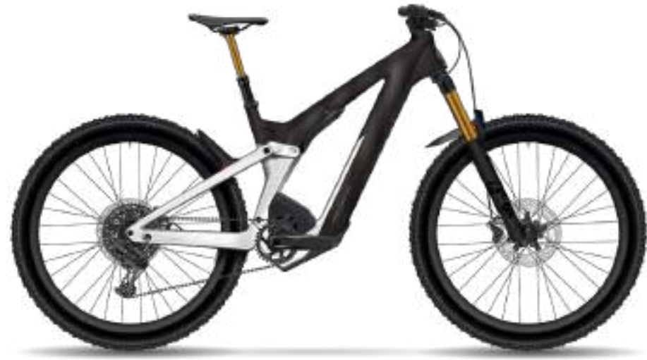
PATRON eRIDE 900 TUNED