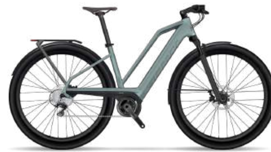
SILENCE eRIDE 20 LADY SPEED