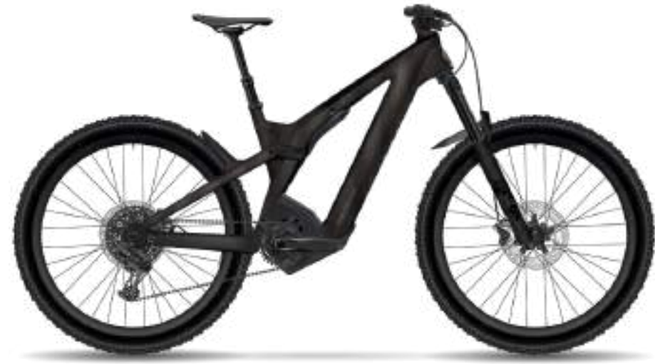
PATRON eRIDE 900