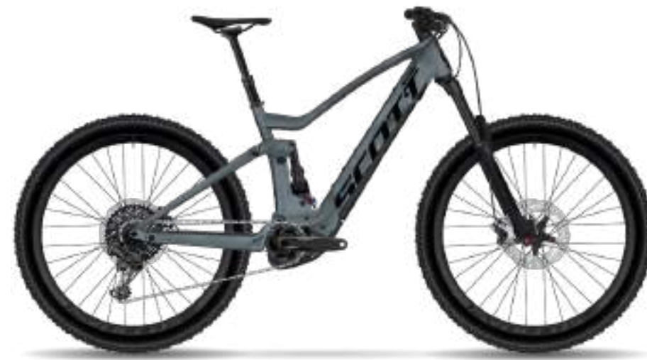
GENIUS eRIDE 930