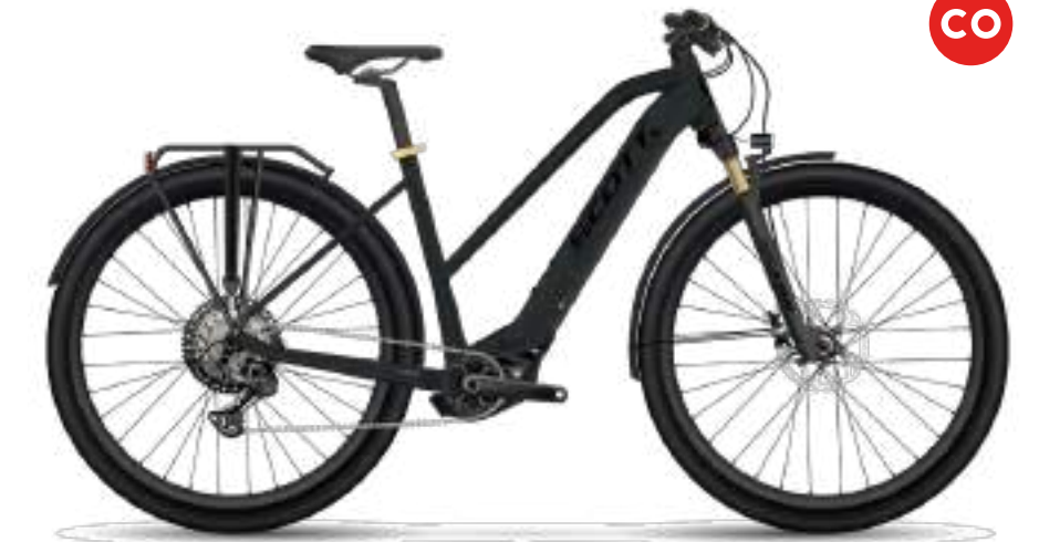
SUB SPORT eRIDE 20 LADY