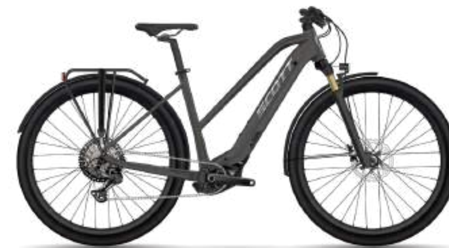
SUB TOUR eRIDE 30 UNISEX