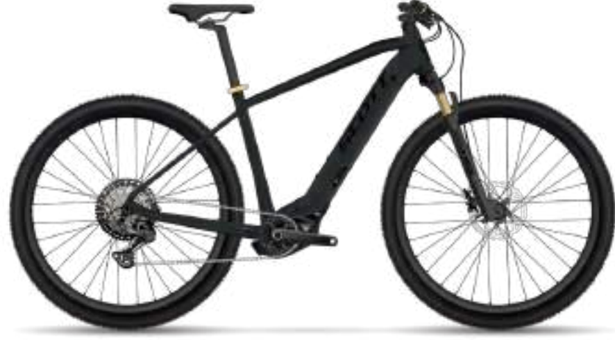
SUB CROSS eRIDE 30 MEN