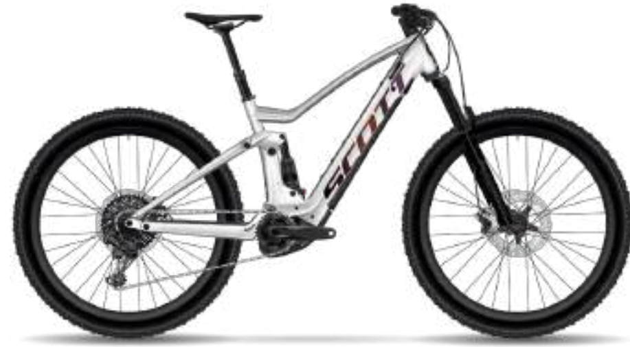
CONTESSA STRIKE eRIDE 920