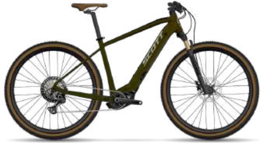
SUB CROSS eRIDE 10 MEN