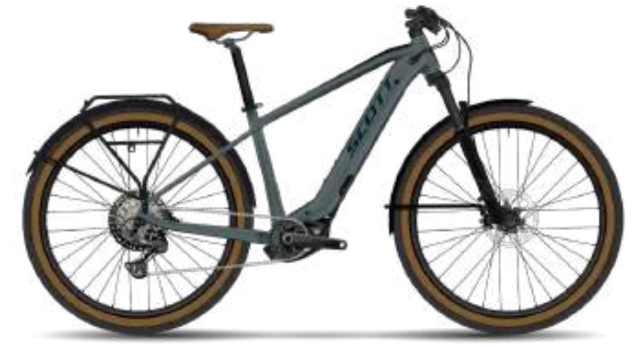
AXIS eRIDE 20 MEN