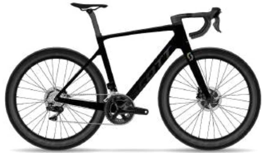
ADDICT eRIDE ULTIMATE