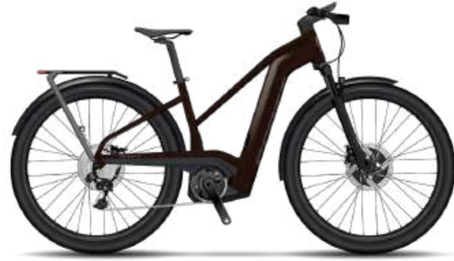
SUB eRIDE EVO LADY