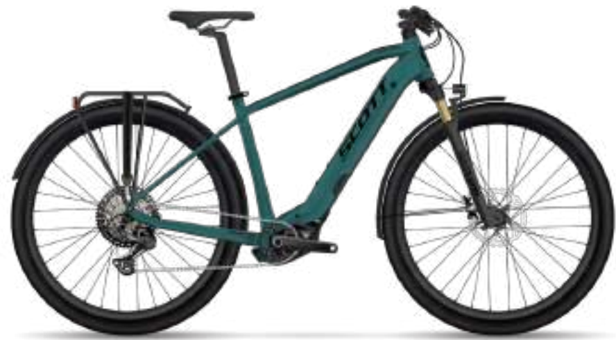
SUB SPORT eRIDE 10 MEN