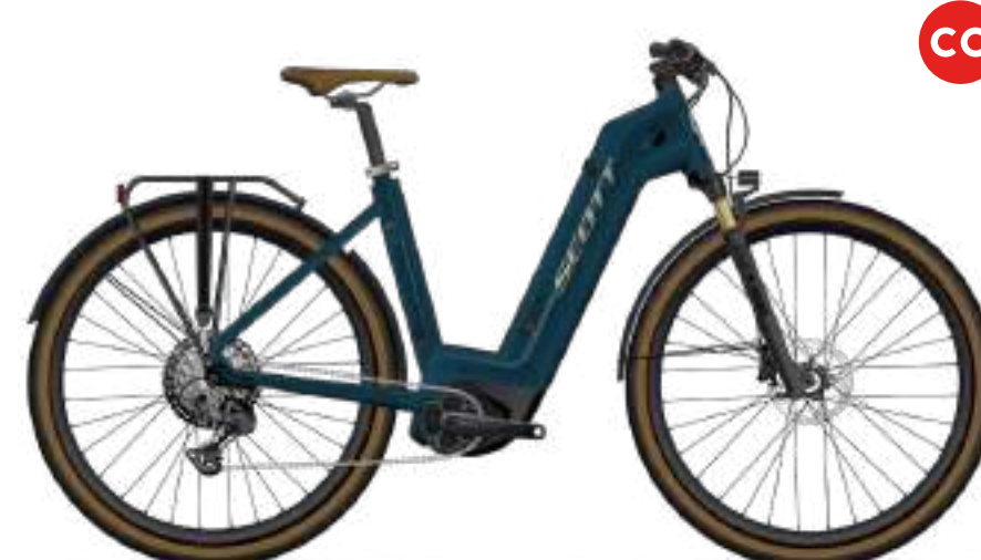
SUB ACTIVE eRIDE USX