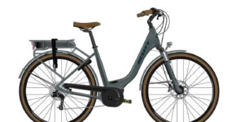
SUB ACTIVE eRIDE 20 UNISEX RACK