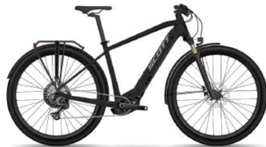
SUB TOUR eRIDE 30 LADY