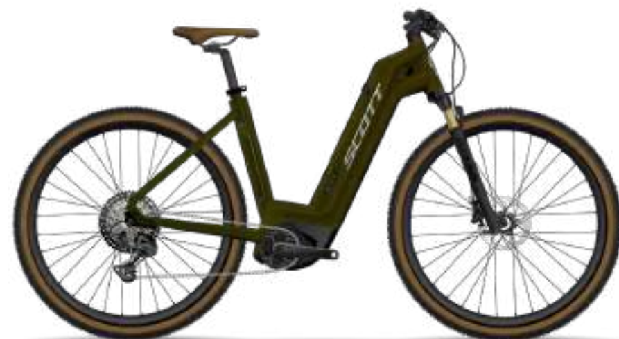
SUB CROSS eRIDE 10 UNISEX