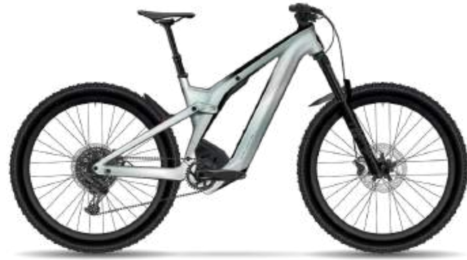
PATRON eRIDE 910