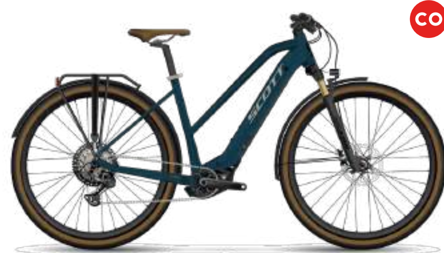
SUB ACTIVE eRIDE LADY