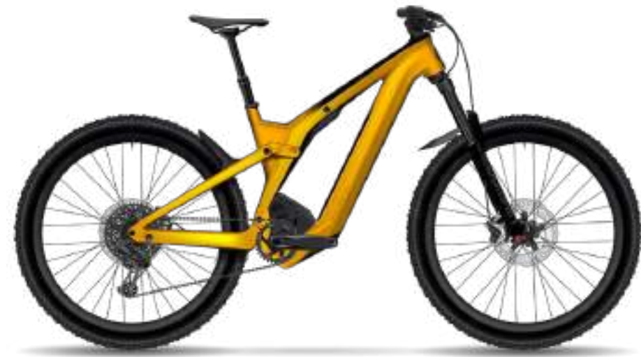
PATRON eRIDE 920 ORANGE