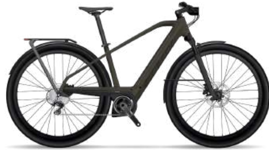
SILENCE eRIDE 10 MEN SPEED