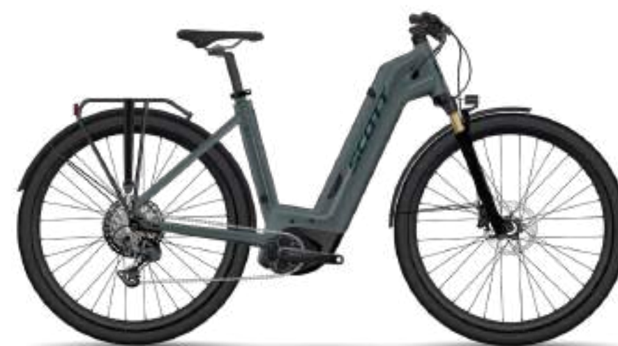
SUB TOUR eRIDE 10 UNISEX