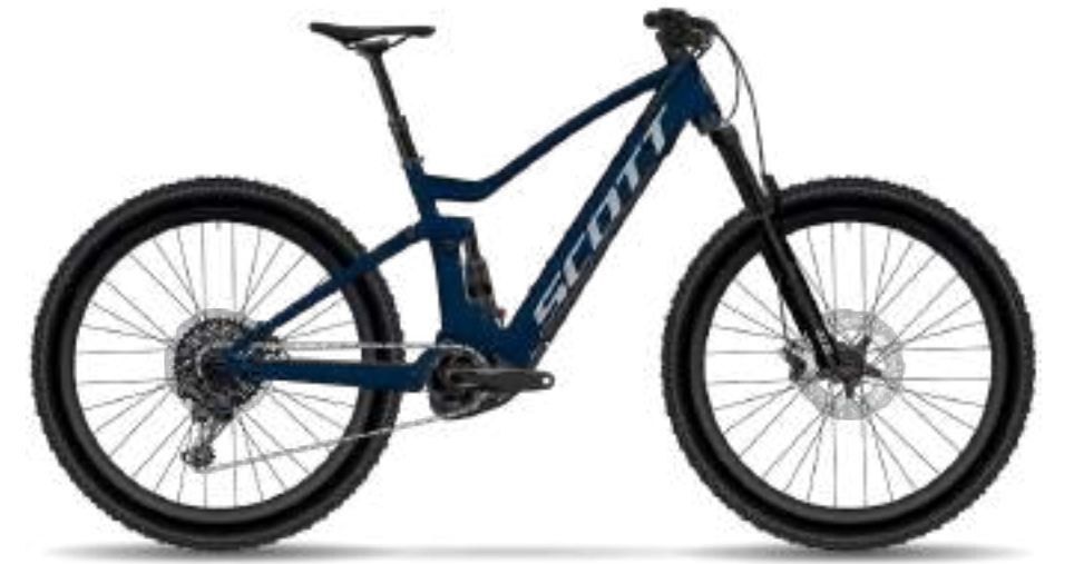
STRIKE eRIDE 940