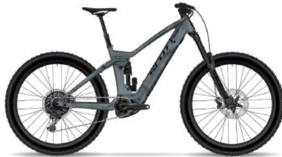
RANSOM eRIDE 920