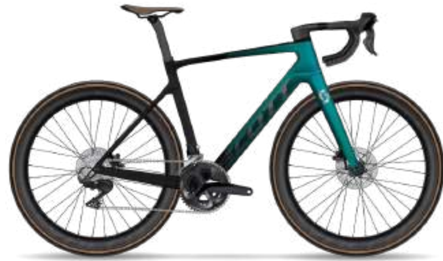
ADDICT eRIDE 10