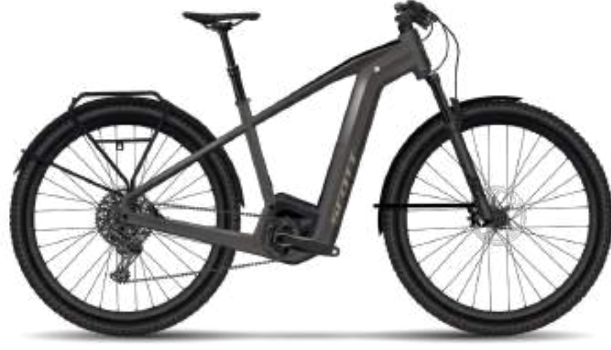
AXIS eRIDE EVO TOUR MEN