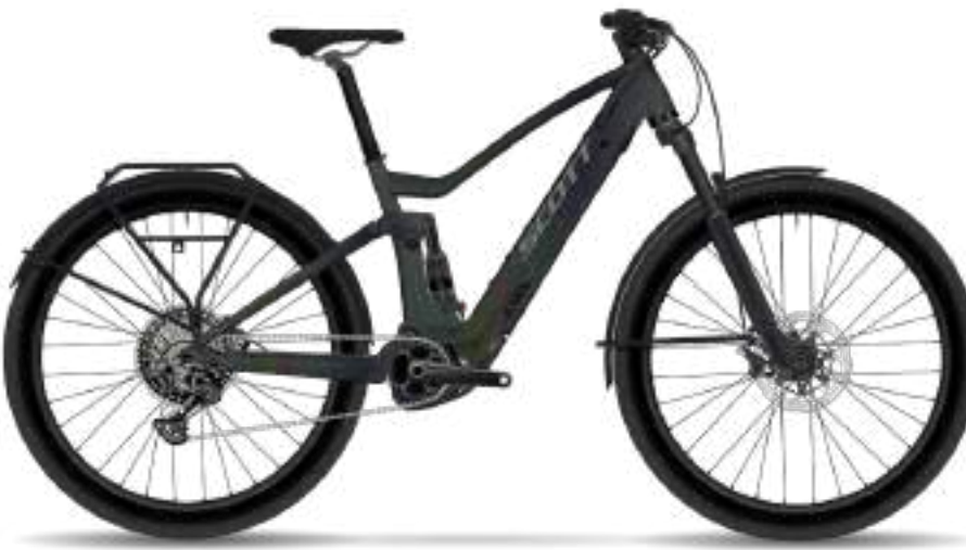
AXIS eRIDE FS