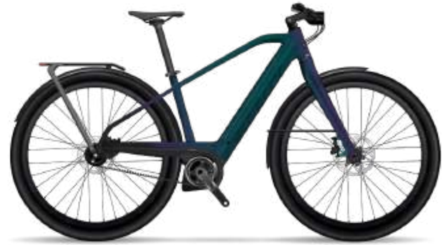
SILENCE eRIDE EVO SPEED