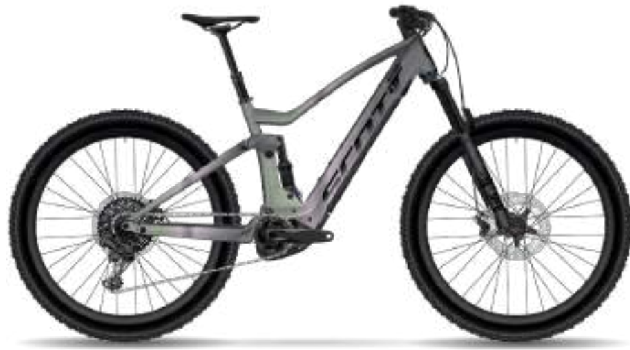
STRIKE eRIDE 920