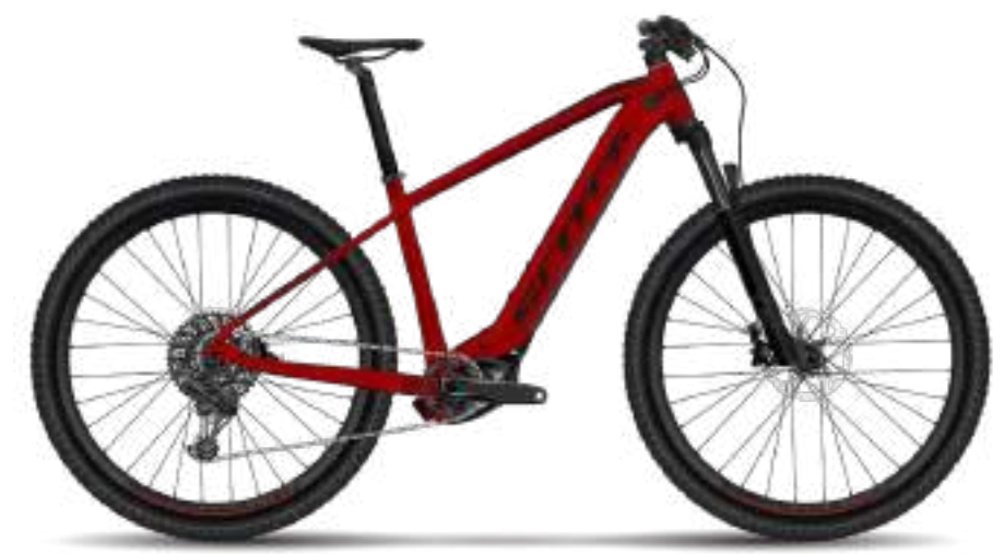
ASPECT eRIDE 920 RED