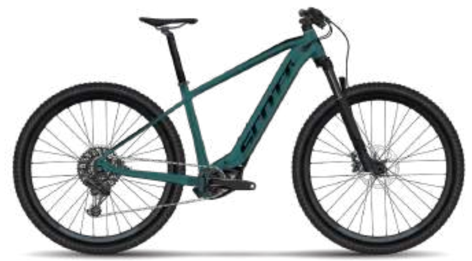
ASPECT eRIDE 910