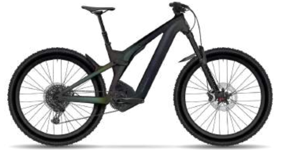
PATRON eRIDE 920 BLACK