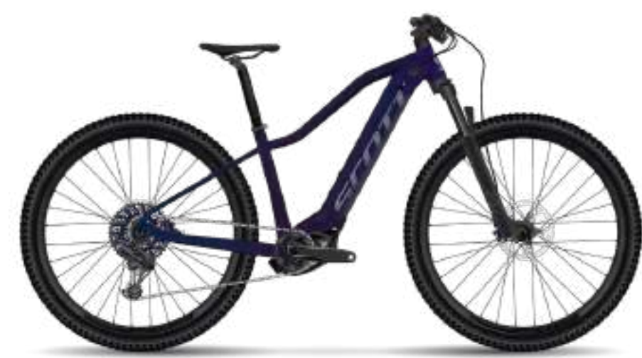
CONTESSA ACTIVE eRIDE 930