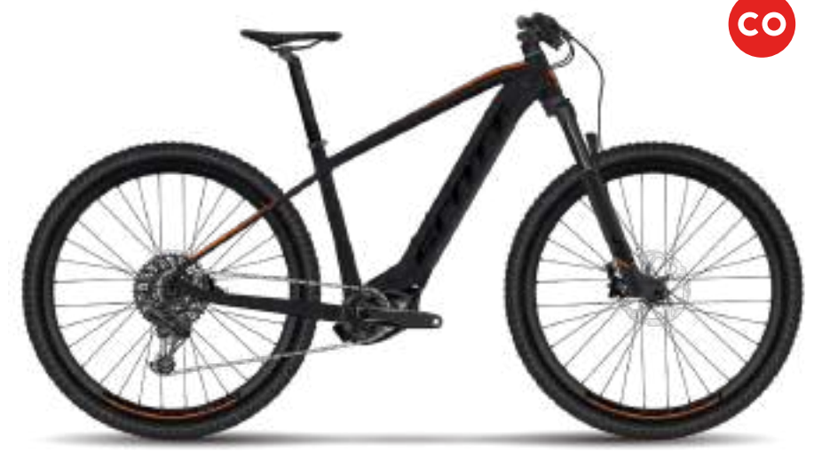
ASPECT eRIDE 920 BLACK