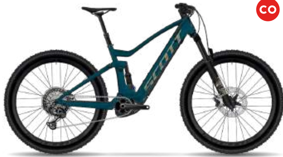
GENIUS eRIDE 920