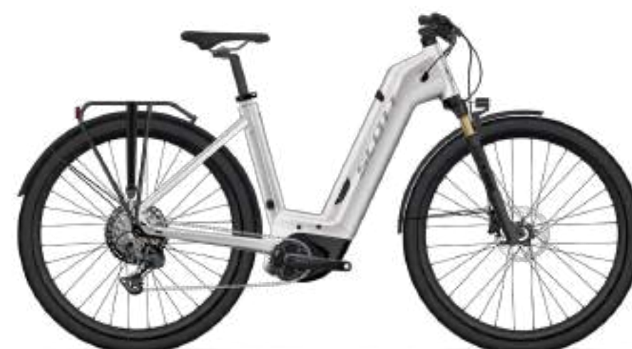
SUB SPORT eRIDE 10 UNISEX