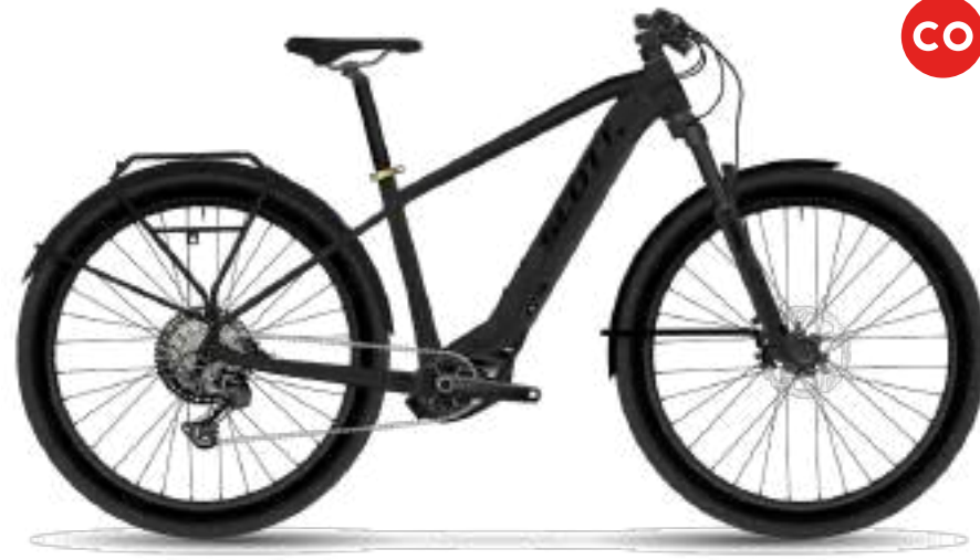
AXIS eRIDE 10 MEN