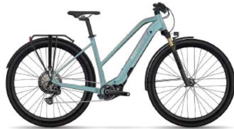
SUB SPORT eRIDE 10 LADY