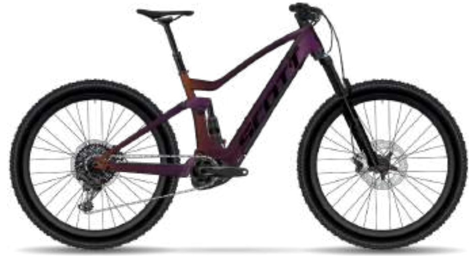
CONTESSA STRIKE eRIDE 910