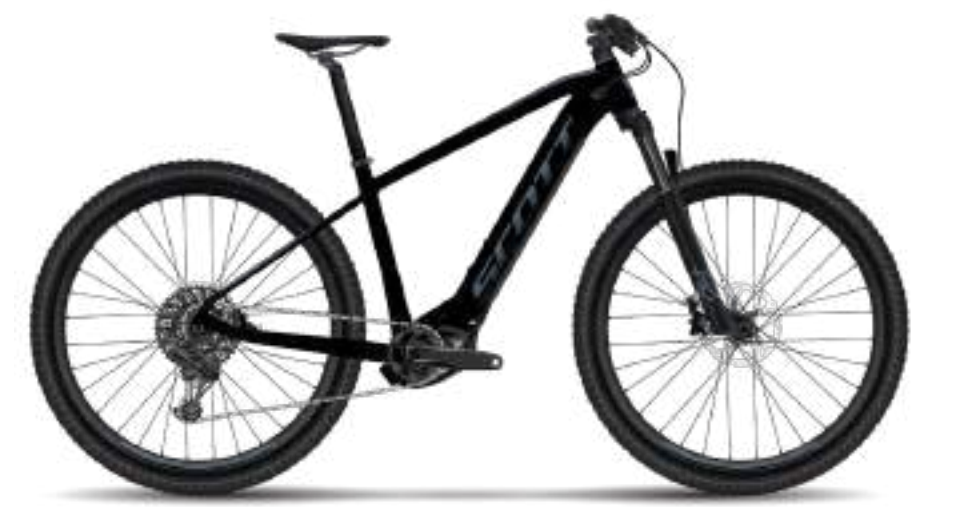
ASPECT eRIDE 940