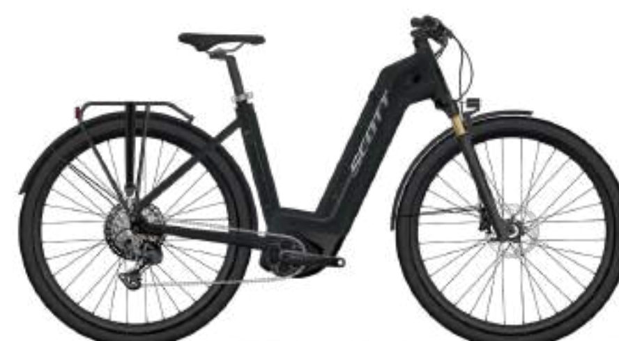
SUB TOUR eRIDE 30 UNISEX