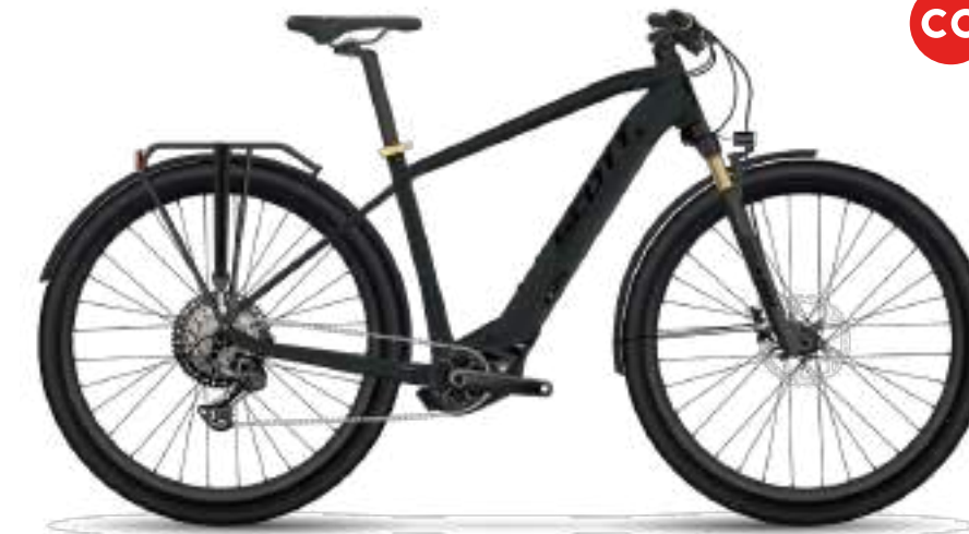
SUB SPORT eRIDE 20 MEN