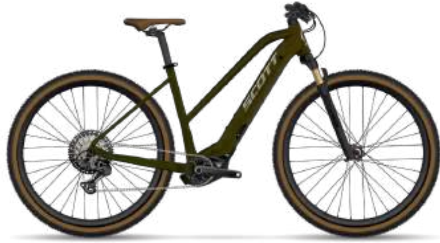
SUB CROSS eRIDE 10 LADY