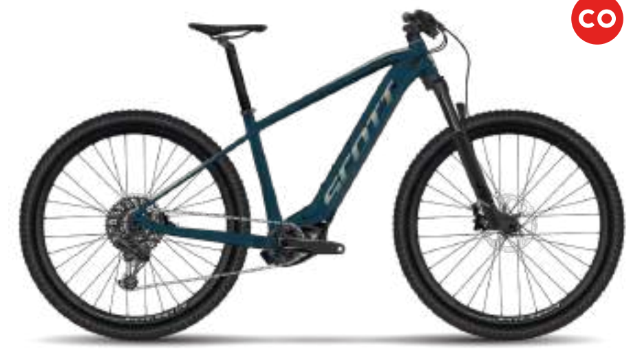
ASPECT eRIDE 930