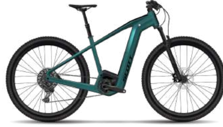
AXIS eRIDE EVO MEN