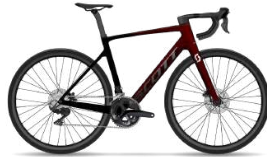
ADDICT eRIDE 30