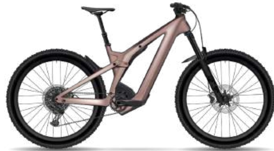
CONTESSA PATRON eRIDE 910