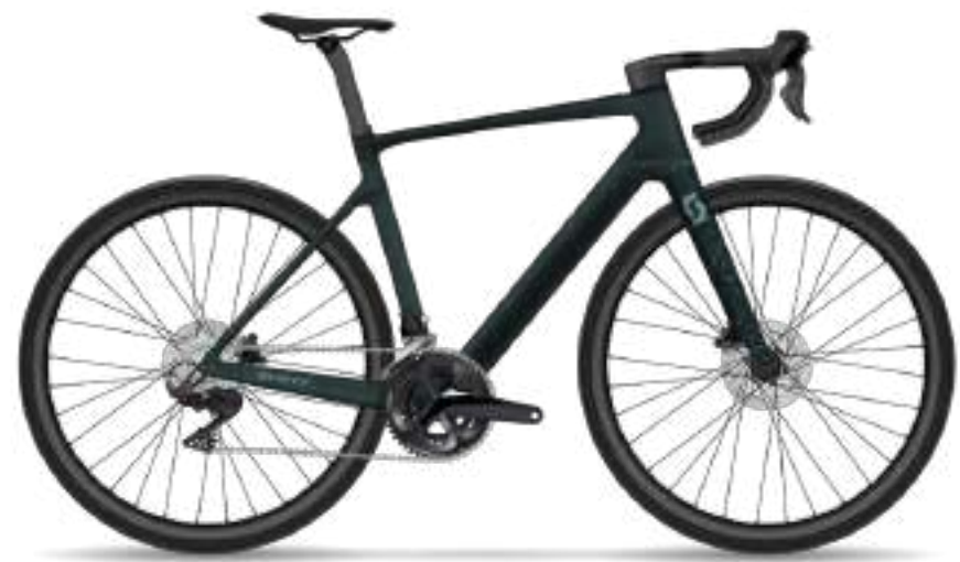
CONTESSA ADDICT eRIDE 15