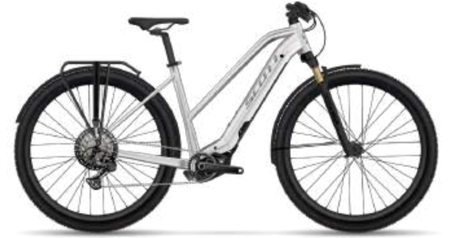
SUB CROSS eRIDE 20 EQ LADY