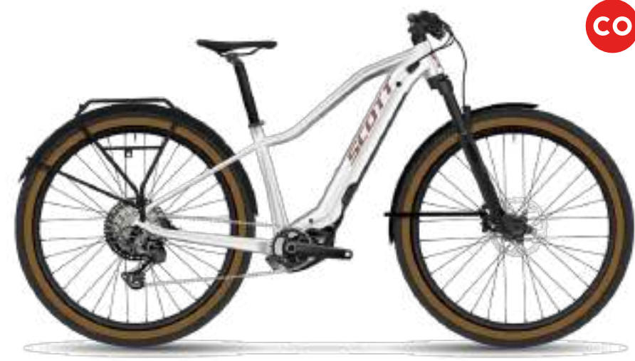
AXIS eRIDE 10 LADY