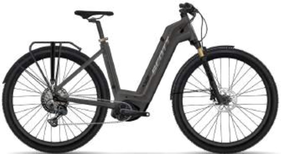
SUB CROSS eRIDE 20 EQ UNISEX