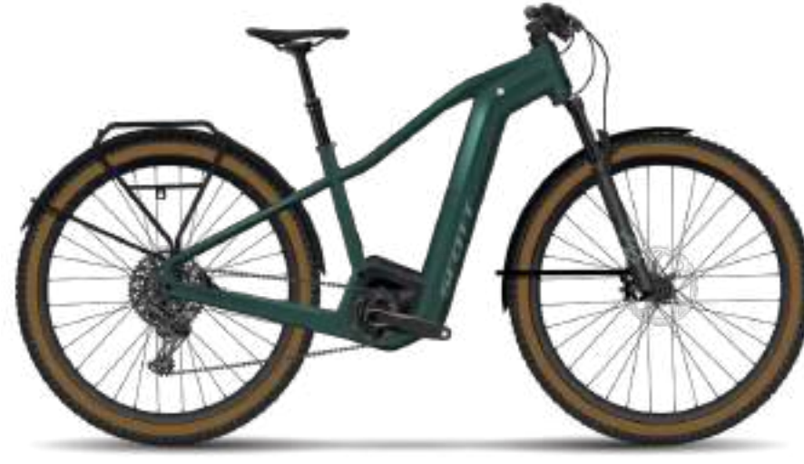
AXIS eRIDE EVO TOUR LADY