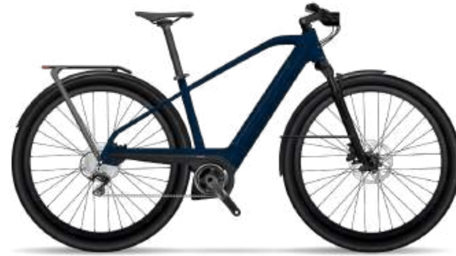
SILENCE eRIDE 20 MEN SPEED