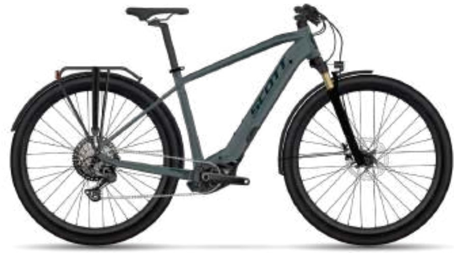
SUB TOUR eRIDE 10 MEN