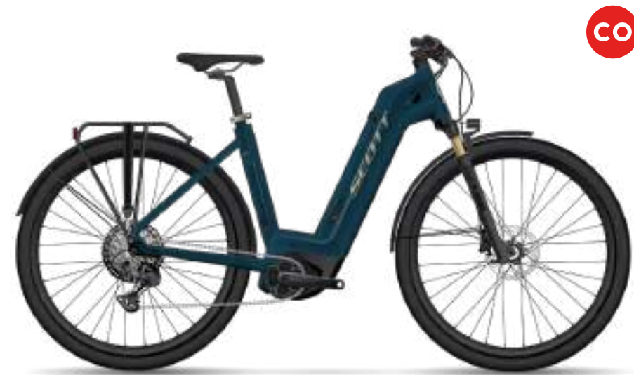
SUB TOUR eRIDE 20 USX