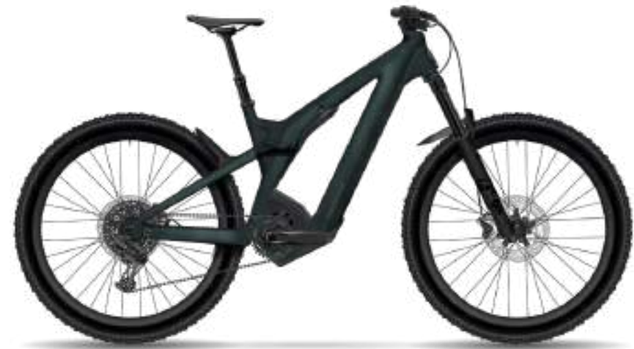
CONTESSA PATRON eRIDE 900