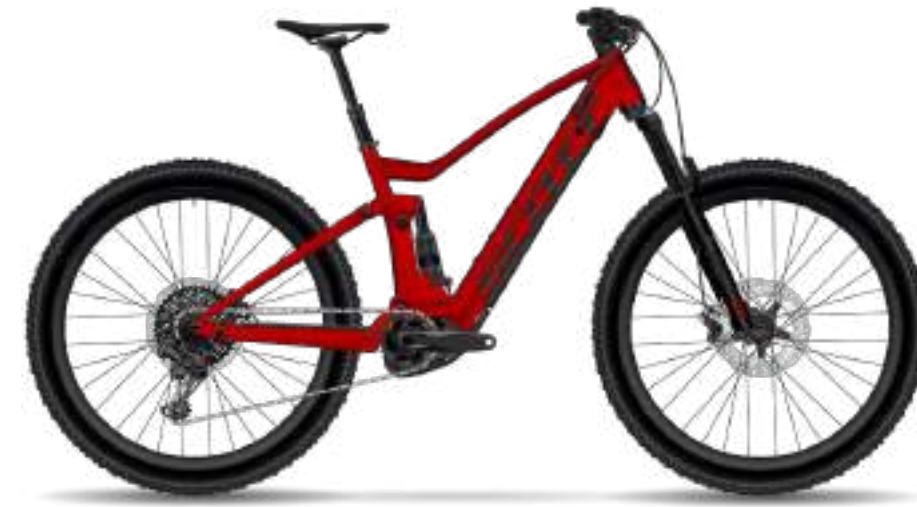
STRIKE eRIDE 930 RED