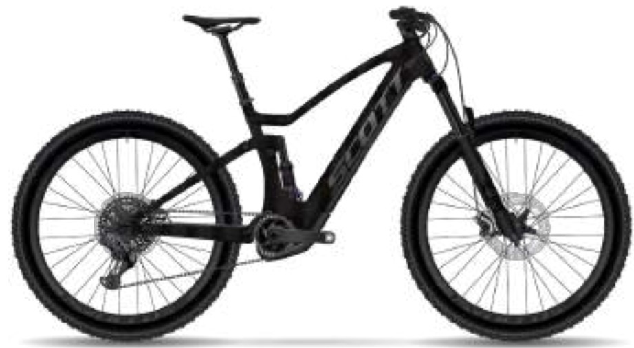
GENIUS eRIDE 910