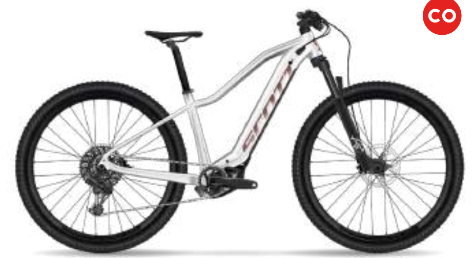
CONTESSA ACTIVE eRIDE 910