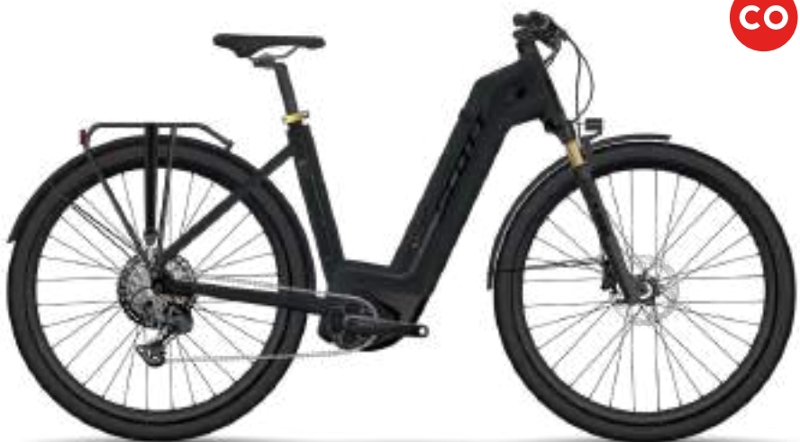
SUB SPORT eRIDE 20 USX