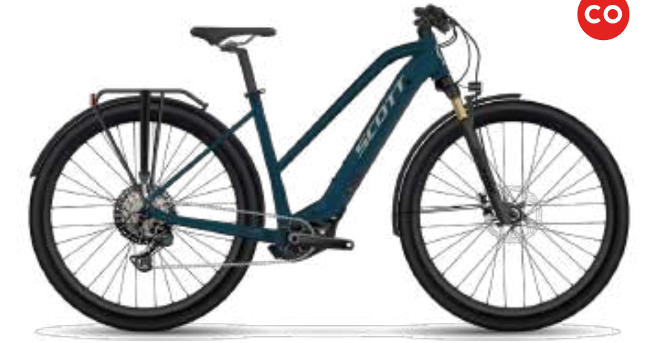
SUB TOUR eRIDE 20 LADY