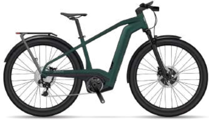
SUB eRIDE EVO MEN