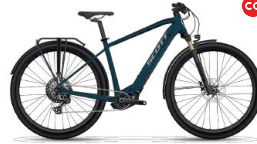
SUB TOUR eRIDE 20 MEN