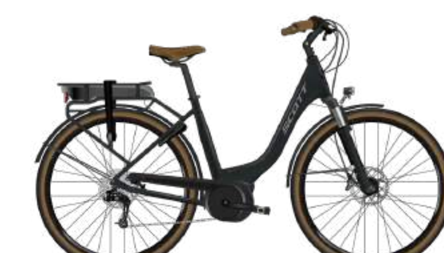
SUB ACTIVE eRIDE 10 UNISEX RACK