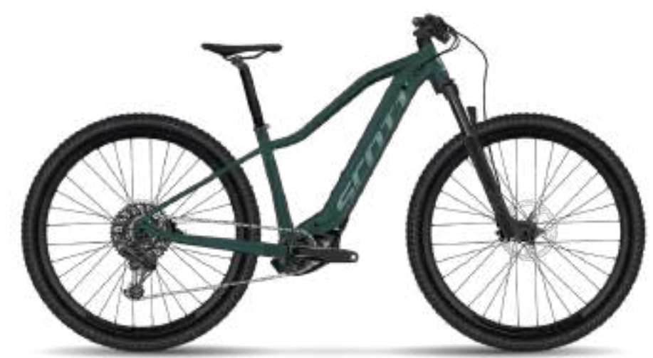
CONTESSA ACTIVE eRIDE 920