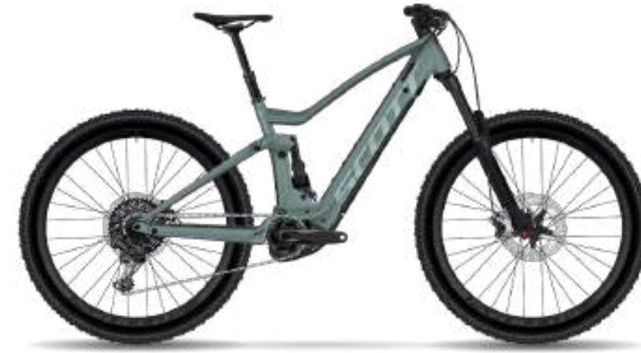
CONTESSA GENIUS eRIDE 910