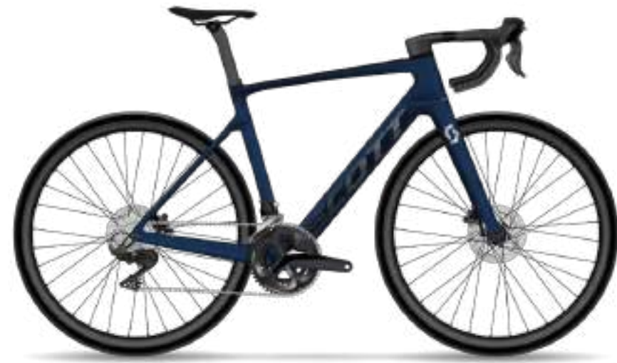
ADDICT eRIDE 20